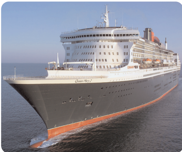
Lloyd's Register's PCAC was awarded to Queen Mary 2 .